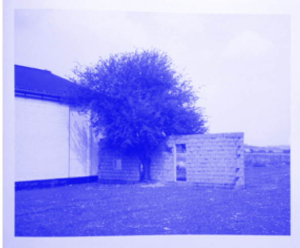
PEDRO CABRITA REIS, Room for a poet (2000)