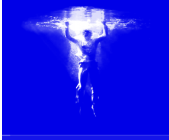
BILL VIOLA, Ascencion (2000)