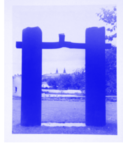
EDUARDO CHILLIDA, Door of music (1993)